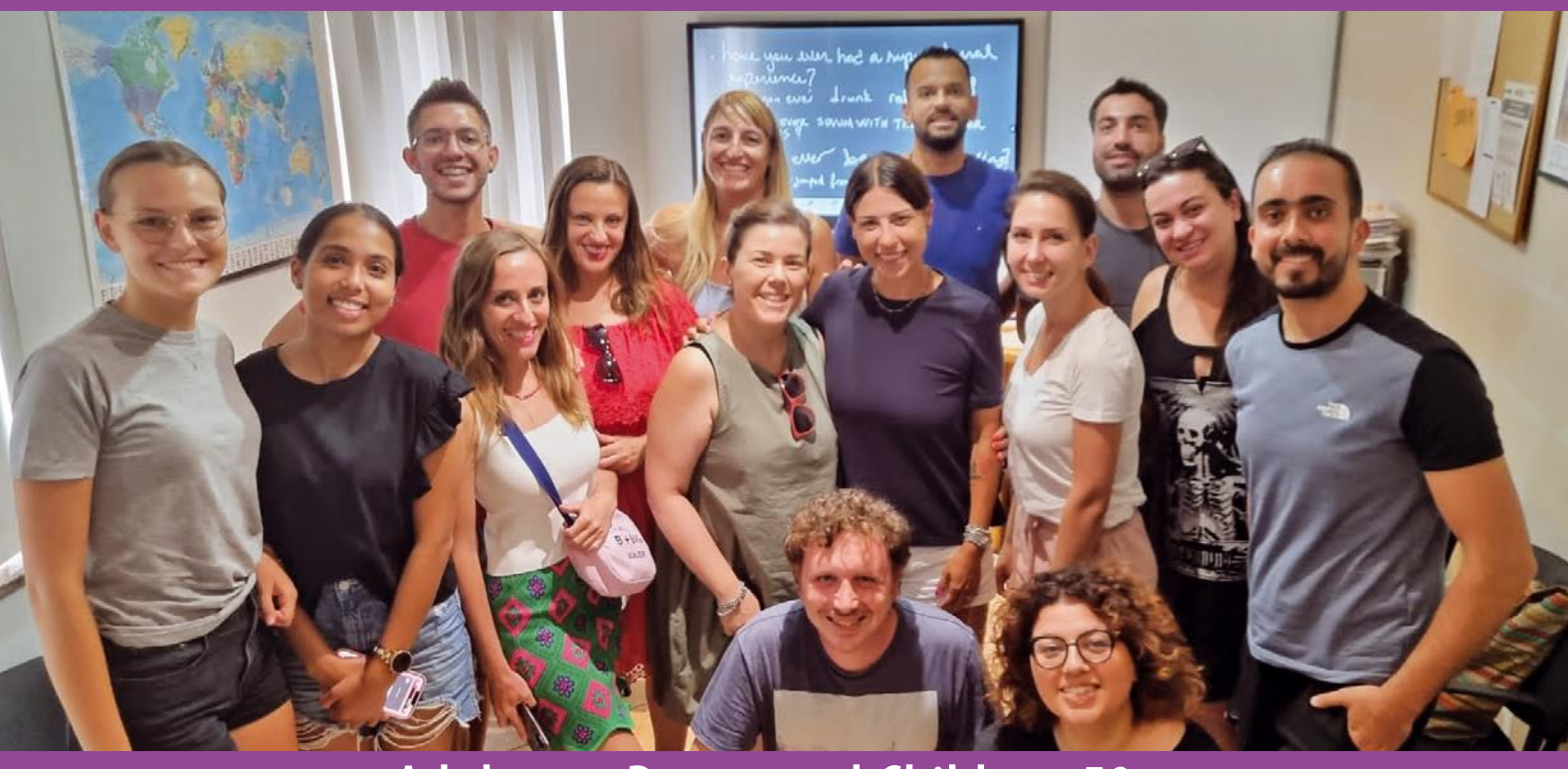
Adults • Parent and Child • 50+ Price List and Brochure 2025