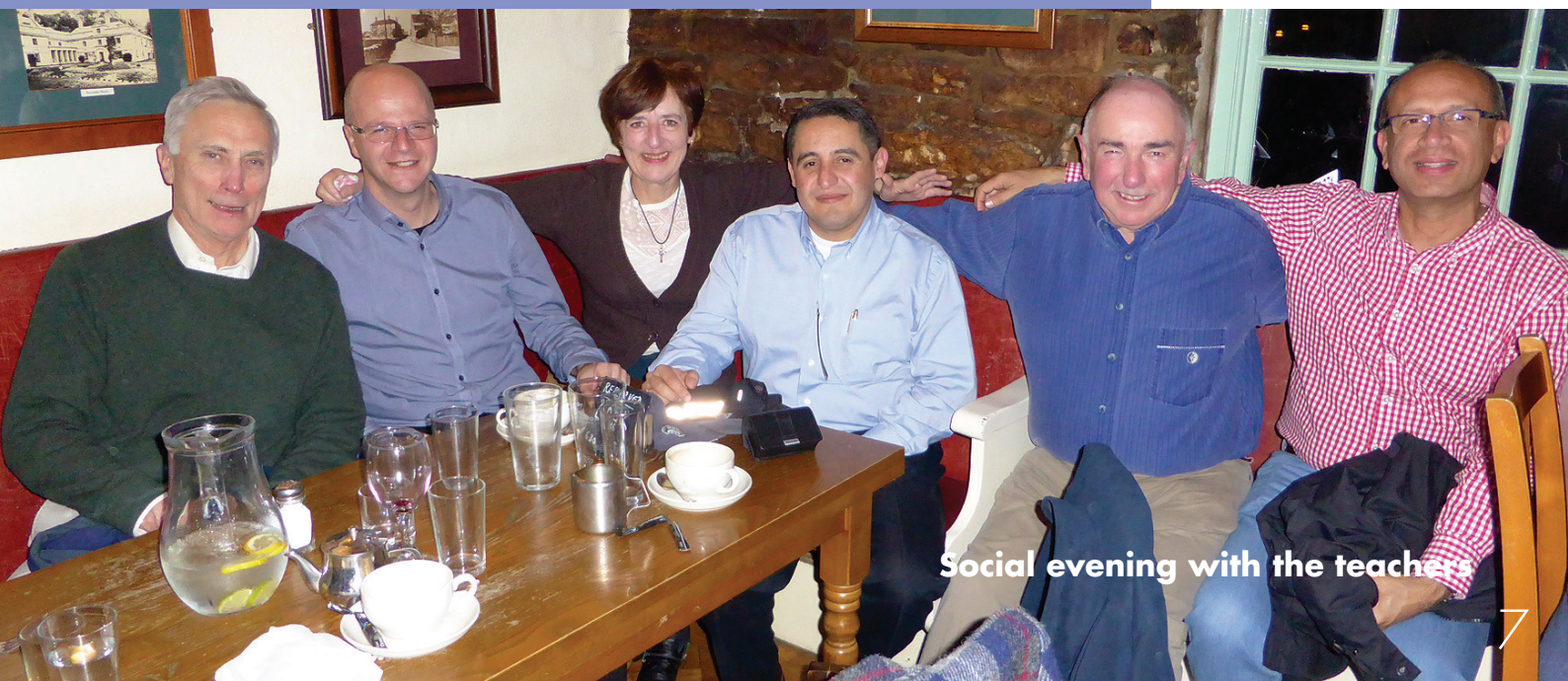
Social evening with the teachers

You do not need to worry if you have a low level of English or if it has been a long time since you studied in the classroom. Whether you are a beginner or a graduate in English, the teaching will be productive, enjoyable and appropriate to your needs.