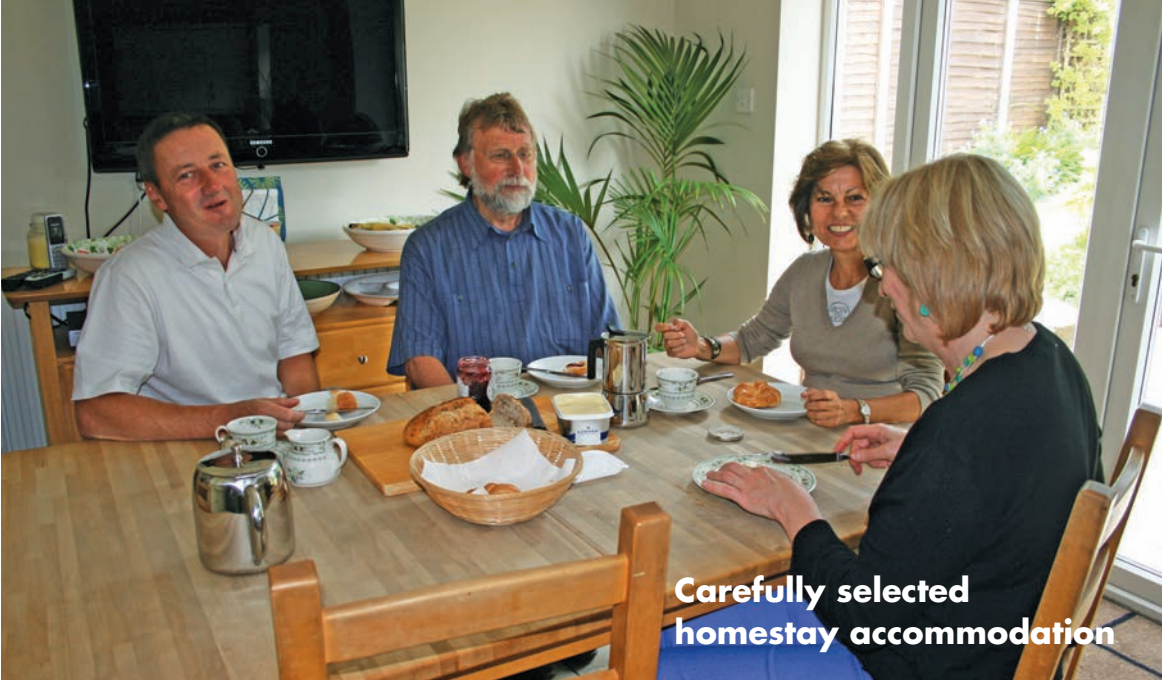
Carefully selected homestay accommodation

70 years' experience in teaching English to the world!