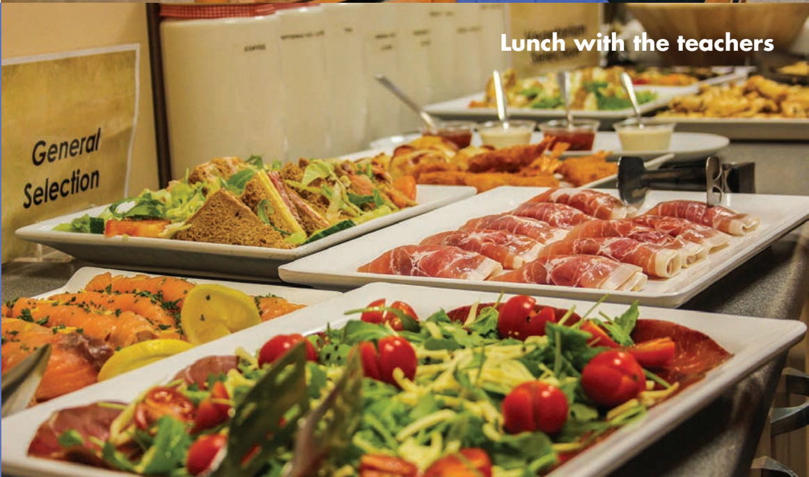
Lunch with the teachers