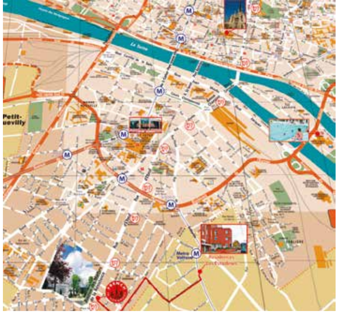
City Map showing FIN

Because we don't just say we care, we really do!