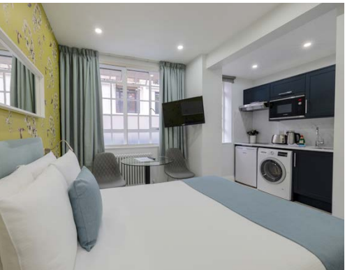
2 Chelsea Cloisters ***