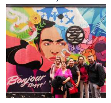
Visit to University College Cork