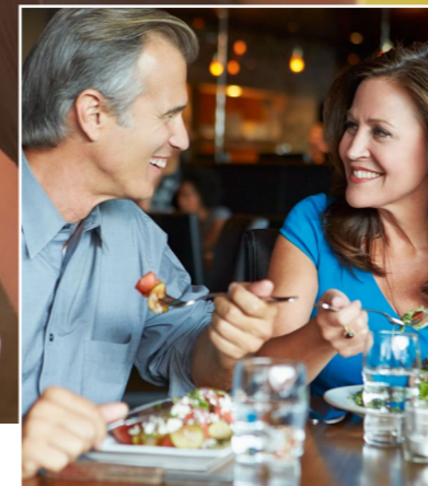
Max 4, Max 1, English and Golf, Discover Devon and Language Holidays for Adults all include networking lunches

SAMPLE TIMETABLE: ihtorquay.uk/courses/english-plus-golf