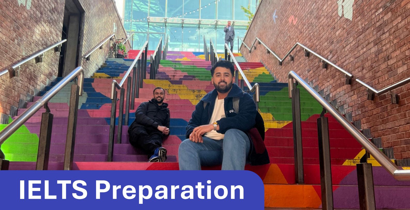
IH Manchester staff and student