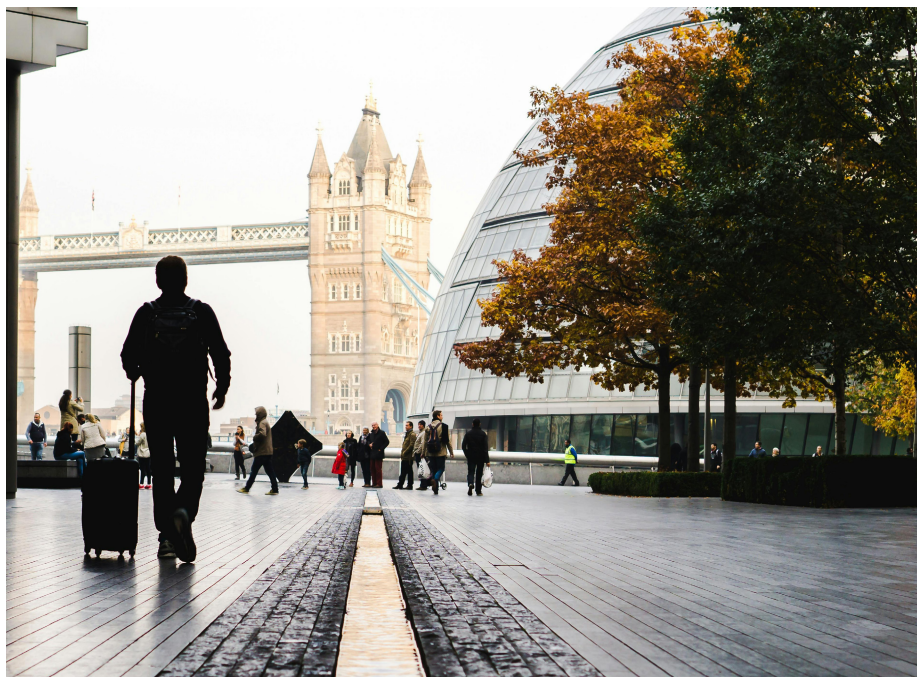
The South West (SW) and South East (SE) regions of England, as well as London (LDN), appear to have a higher concentration of the highest-scoring schools.

To provide the most accurate and up-to-date rankings, we have now changed our policy. This year, we are using all available