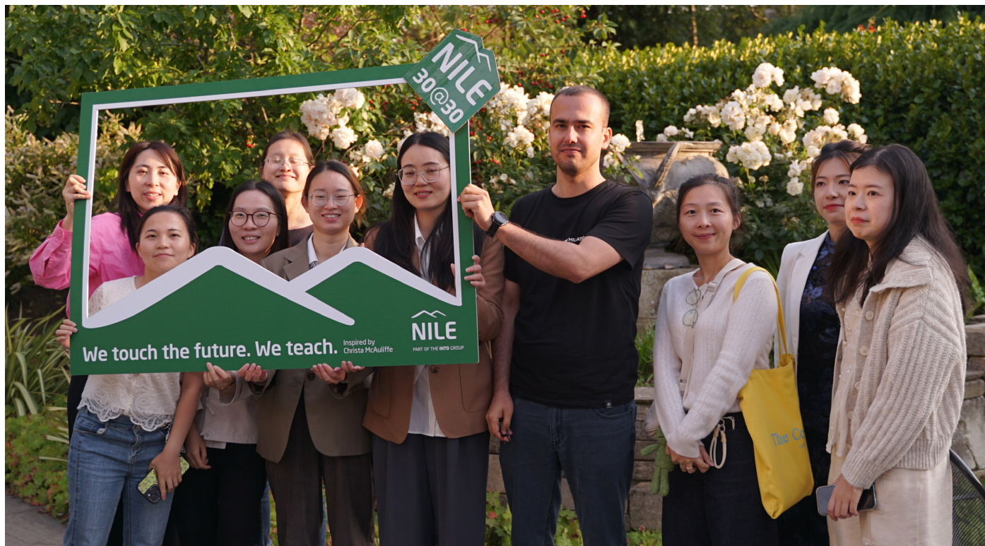
NILE celebrating turning 30 this year in Norwich. Now it's also celebrating moving up the rankings!

The latest UK language centre rankings from EL Gazette reveal a dynamic landscape, with a mix of stability at the top, significant improvements for some schools, and the emergence of new players. A direct comparison of the 2024-25 and 2025-26 lists highlights key trends and changes that agents and prospective students should note.