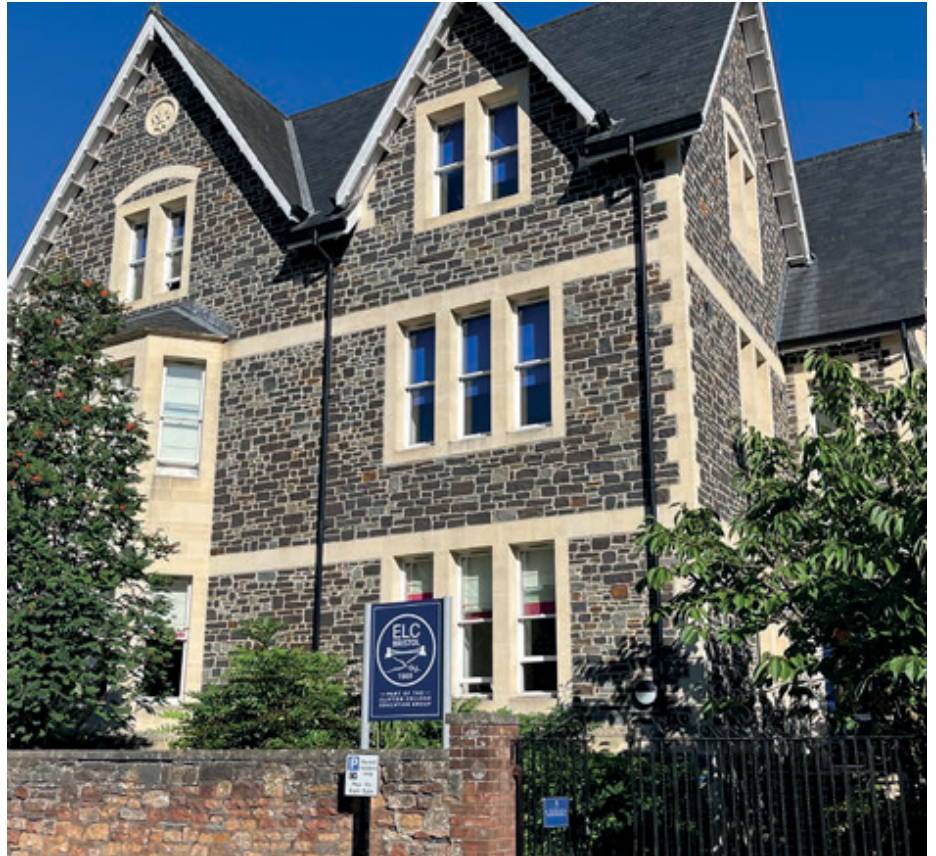
The English Language Centre Bristol offers intensive General English and Examination Preparation courses.

The “†” symbol, which denotes a “slight uplift for centres which are strong in both teaching and Academic Staff Profile”, is strongly correlated with top performance. All seven of the schools with a perfect score of 10 in the 2025-26 rankings have this symbol. This suggests that the new methodology is effectively highlighting schools that excel in these specific areas.