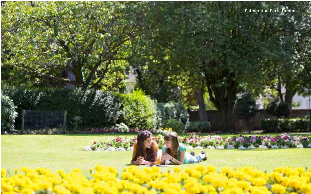
Palmerston Park, Dublin

Get to know the elegant neighbourhoods around our schools in Palmerston Park, Milltown and Marino.