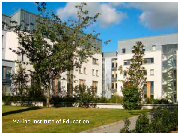
Marino Institute of Education