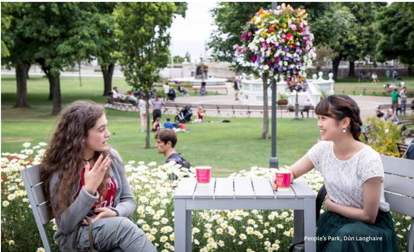
People's Park, Dún Laoghaire

Visit our unique museums, galleries and tourist attractions.