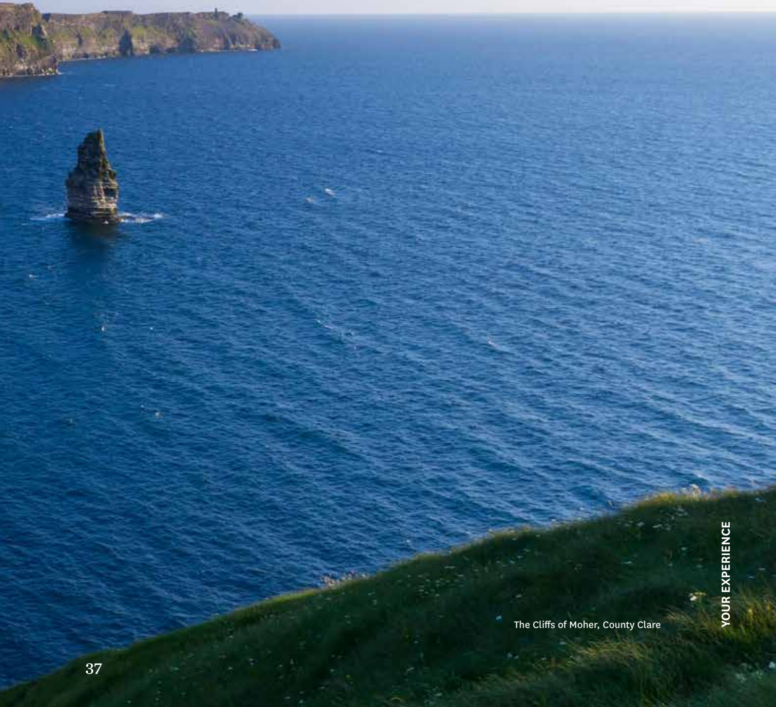
The Cliffs of Moher, County Clare

Discover Ireland and explore its renowned scenic areas such as Clare, Cork, Galway, Kerry and Sligo.