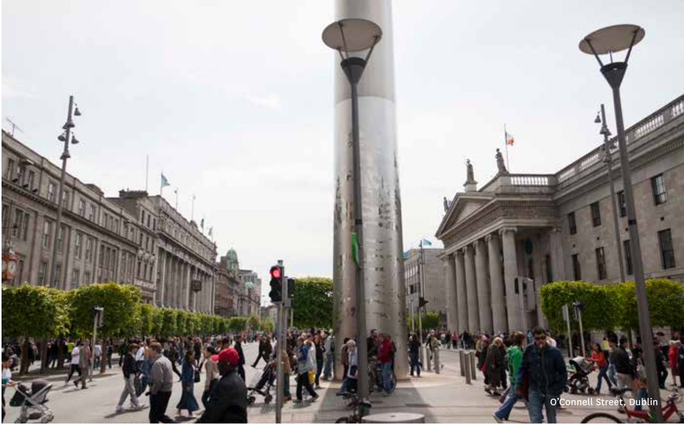
O'Connell Street, Dublin