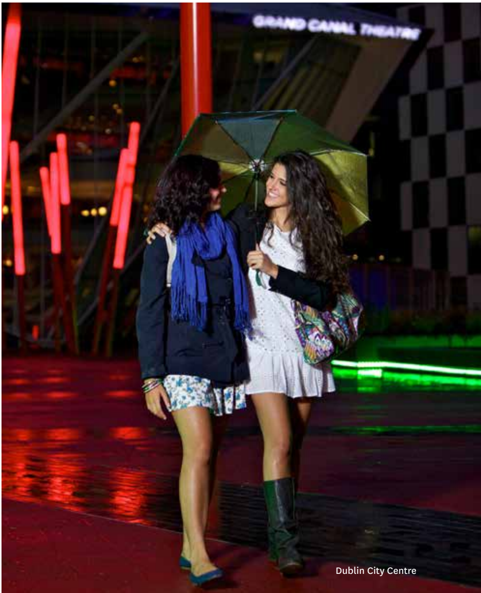
Dublin City Centre