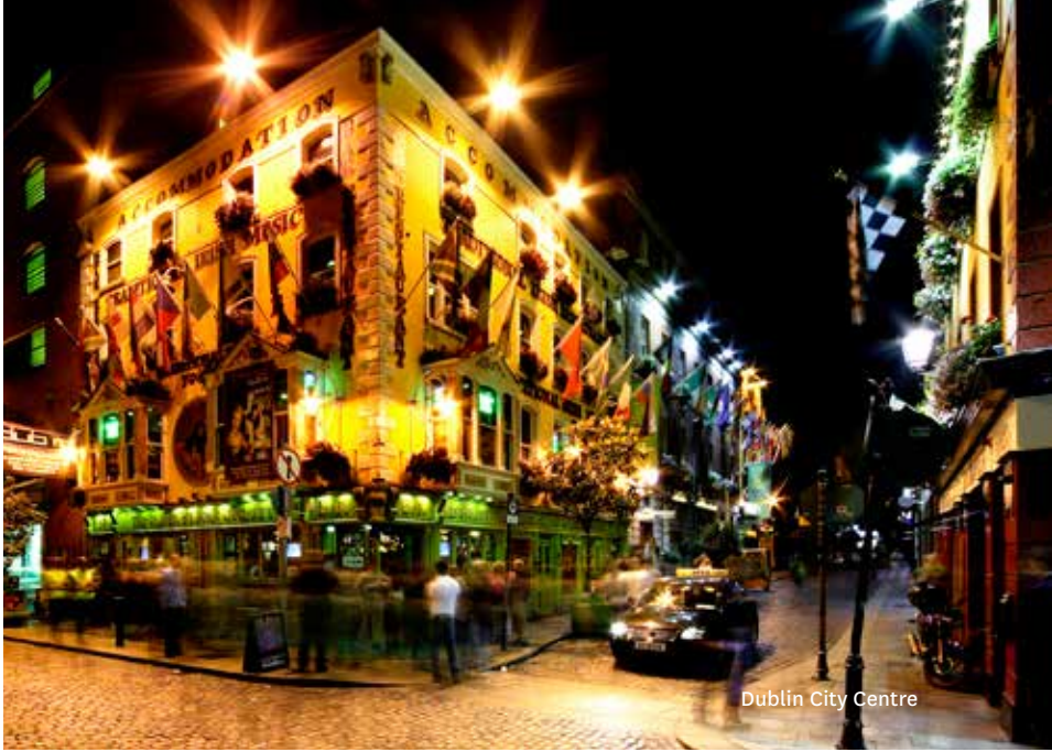
Dublin City Centre