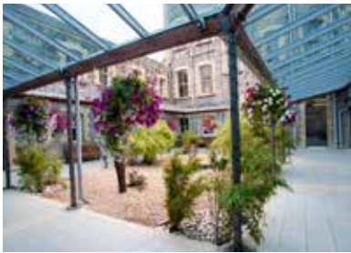
Marino Institute of Education