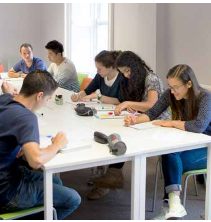
Free supervised study sessions in the afternoons