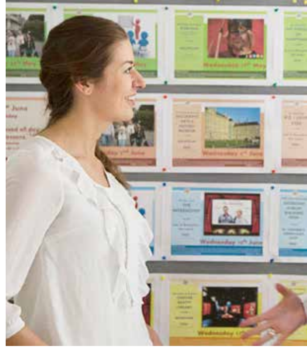
Welcome kit with maps and student handbook with a rich and varied social programme