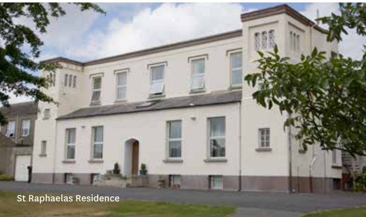
St Raphaelas Residence