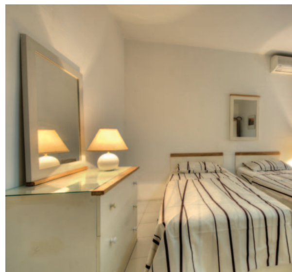
Easy School shared self-catering apartments.