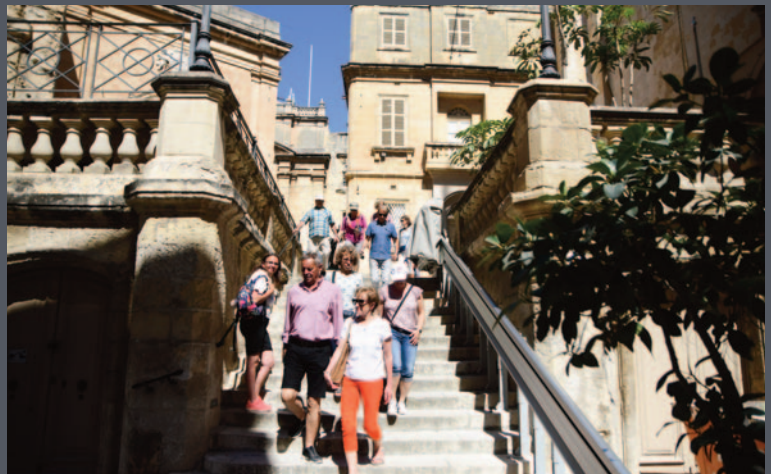
The Three Cities

Ta'Qali, located nearby was once a British WWII outpost, but has been converted to a village for local handicrafts. You will be able to watch local artisans at work blowing elaborate glass art pieces, intricately assembling original silver filigree jewellery, carving the local limestone and many more. This is the perfect place to pick up treasures that will remind you of your Malta visit.