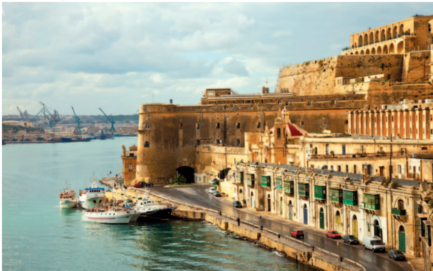
Valletta Grand Harbour