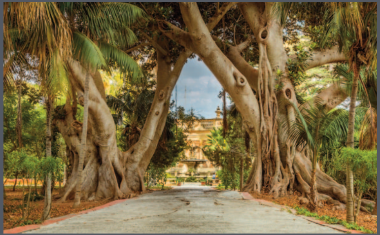
San Anton Gardens