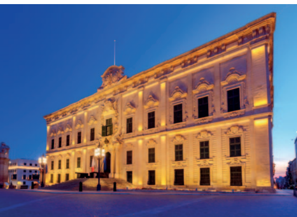
Auberge de Castille