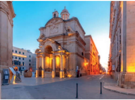
St Catherine's Church