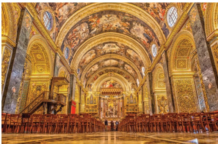
St John's Co-Cathedral