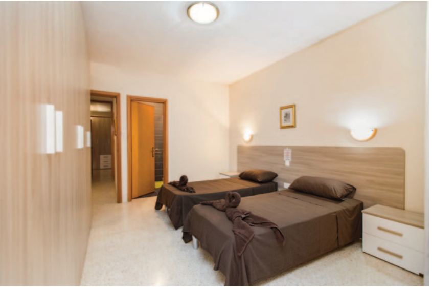
Easy School shared self-catering apartments.