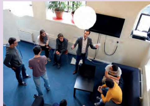
Edinburgh School of English today