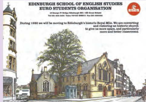
A flyer advertising the move to the Canongate