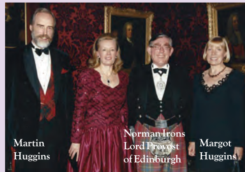
Edinburgh School of English 25th Anniversary dinner