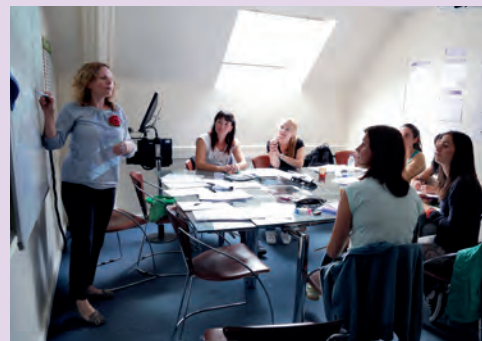
A class in action