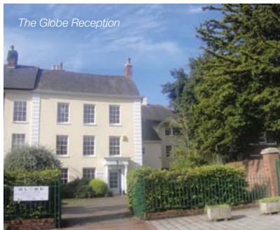
The Globe Reception